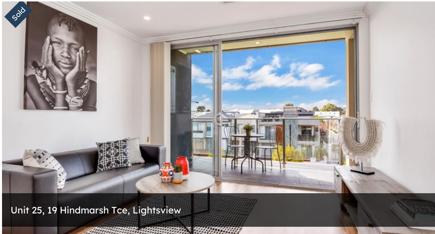
Unit 25, 19 Hindmarsh Tce, Lightsview