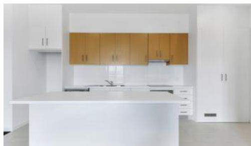
13, 30 Light Terrace, Lightsview