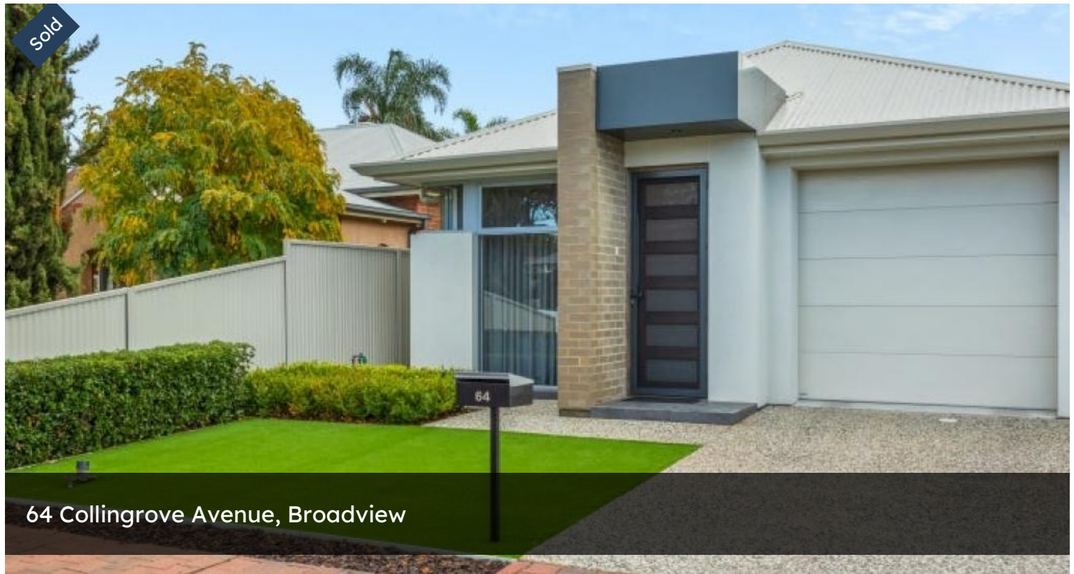
64 Collingrove Avenue, Broadview